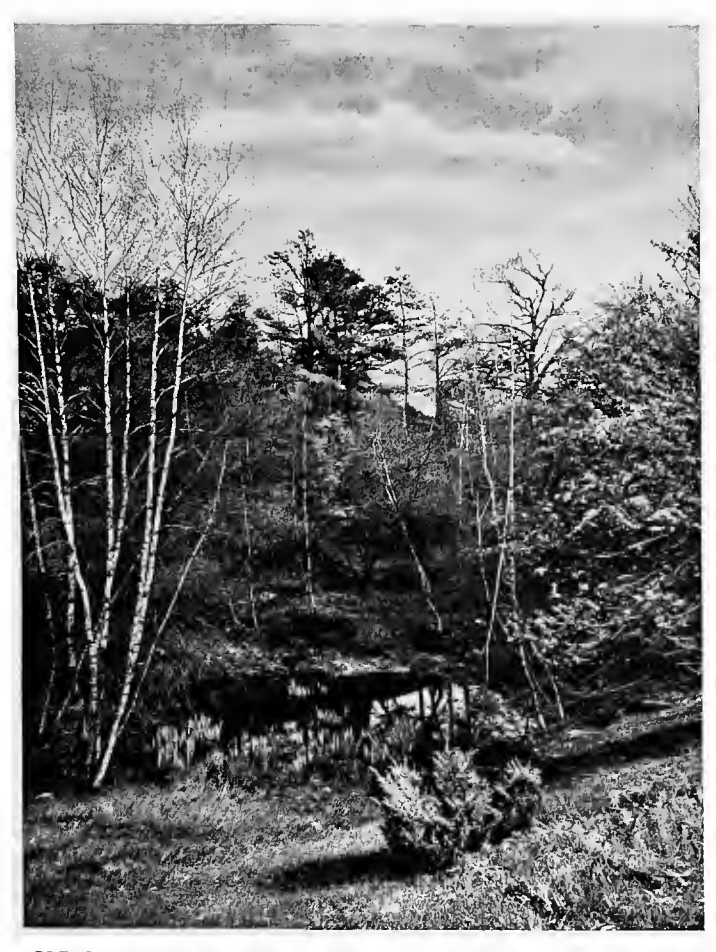
GLEAMS NOW AND THEN A POOL SO SMOOTH AND CLEAR